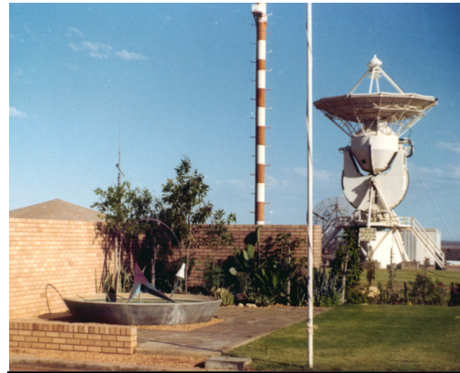
Keeping the Memory Alive